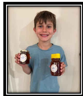
And with his final product