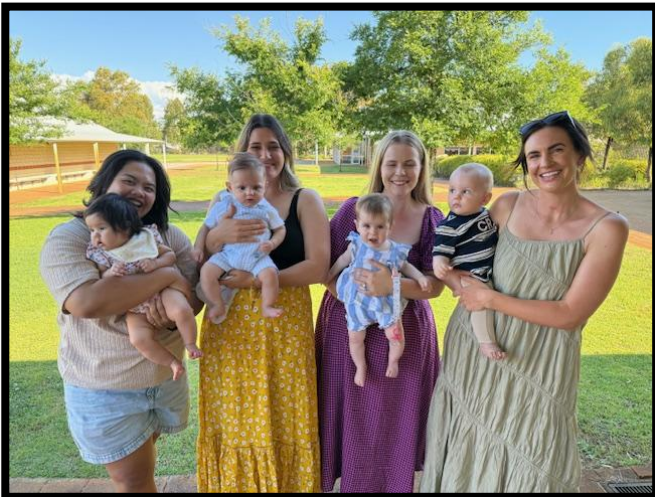
A happy snap of our new mums and their bubs.