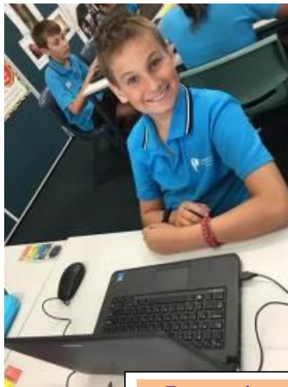
Learning with Technology