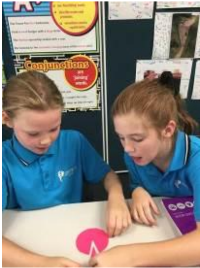
"Hands on" Maths