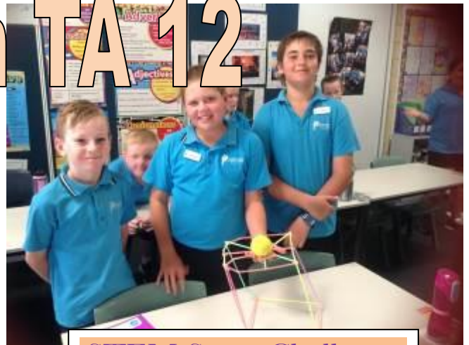
STEM Straw Challenge