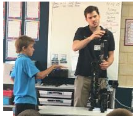
Dexter (Robotic Arm), a 3D printer and Ozobots