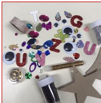
Kelly Collins Chaplain

With Christmas only being a few weeks away, we have introduced some craft activities to the program. The students will still have the opportunity to work on colouring in pages but they will also have the option of decorating a Christmas decoration which they can then take home. This will be another perfect way for students to use their creativity while cooling off and socialising with other students.