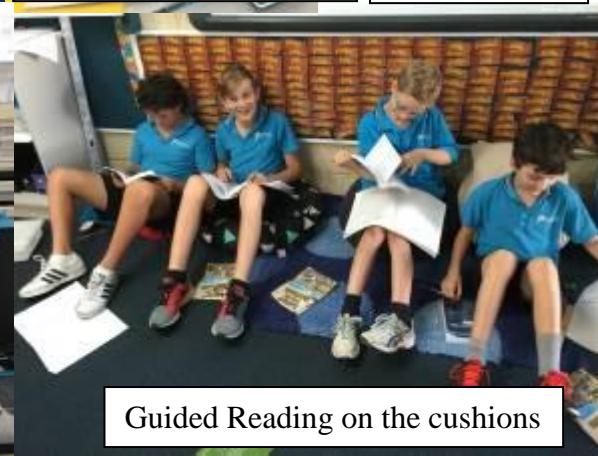
Guided Reading on the cushions