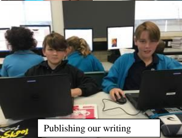
Publishing our writing