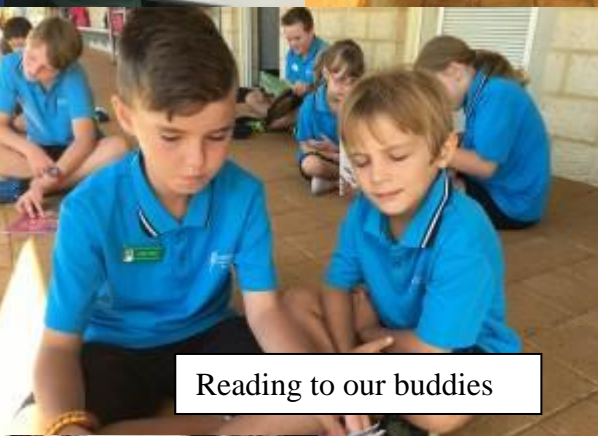
Reading to our buddies